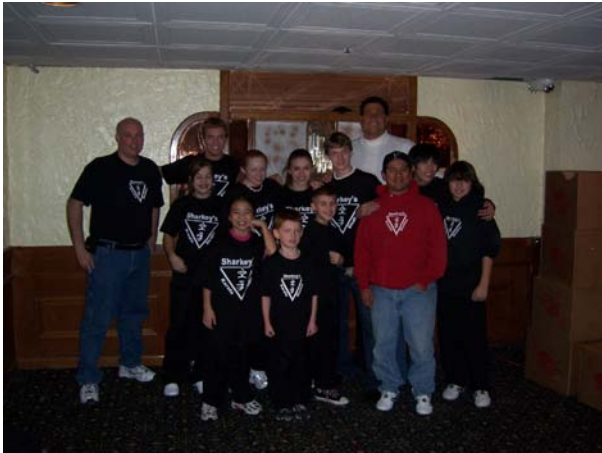
Group photo taken with Dan Hampton

On Sunday, December 18 th , the team performed for Trilla Steel Drum Corporation's Christmas party, at Nikos Restaurant, in Bridgeview. The students were treated to a delicious dinner and were able to meet Chicago Bear, Superbowl Champion, Dan Hampton. All the students and the parents were very excited to meet him and even more excited to get a picture with him!